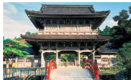
Sōji-ji Soin Temple (總持寺祖院)

山中、山代、片山津、粟津からなる加賀温泉郷は和倉温泉とともに全国有数の温泉地として快適な宿泊施設とゆきとどいたサービスで、年間69万人の温泉客をもてなしています。温泉地の周辺には、越前加賀海岸国立公園、那谷寺、ゴルフ場等があり、九谷焼、山中漆器などの伝統産業と一体となった一大観光地を形成しています。