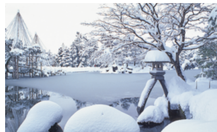
Kenrokuen Garden (兼六園)