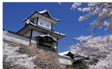
Kanazawa Castle (金沢城)