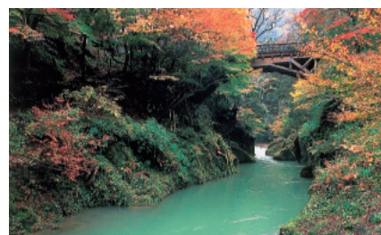
Kakusenkei Gorge (鶴仙溪)